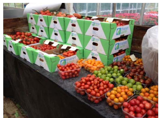
Every week through the summer the greenhouse provides a technicolour mix of trial tomato varieties.